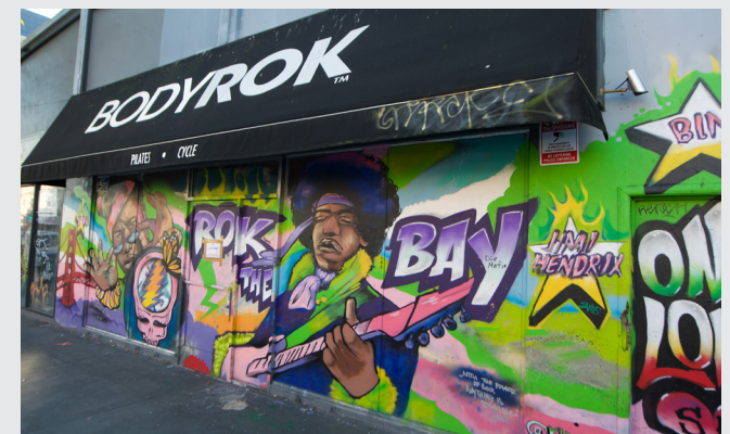
(Next Door to Body Rok)