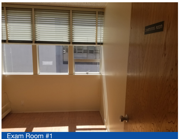
Exam Room #1